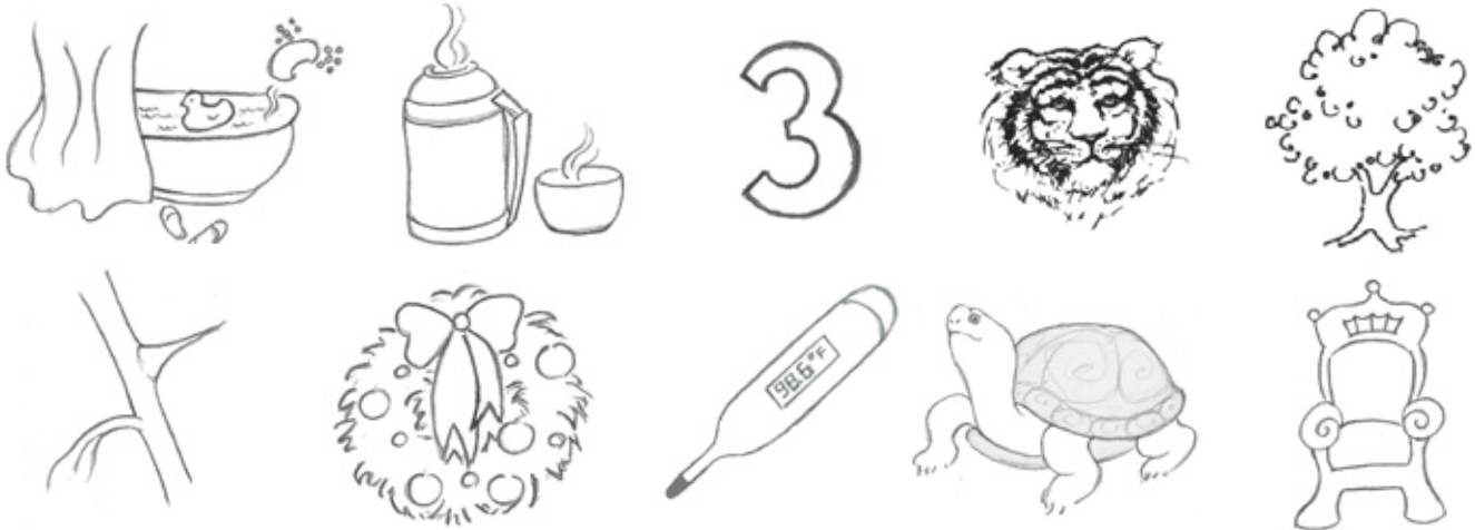
(Pictures: bath, thermos, three, tiger, tree, thorn, wreath, thermometer, turtle, throne)

Point to the pictures with the th sound at the beginning of the word.