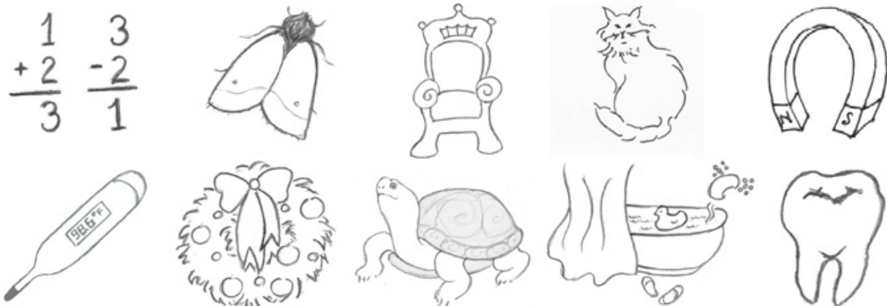
(Pictures: math, moth, throne, cat, magnet, thermometer, wreath, turtle, bath, tooth)

Point to the pictures with the th sound at the end of the word.